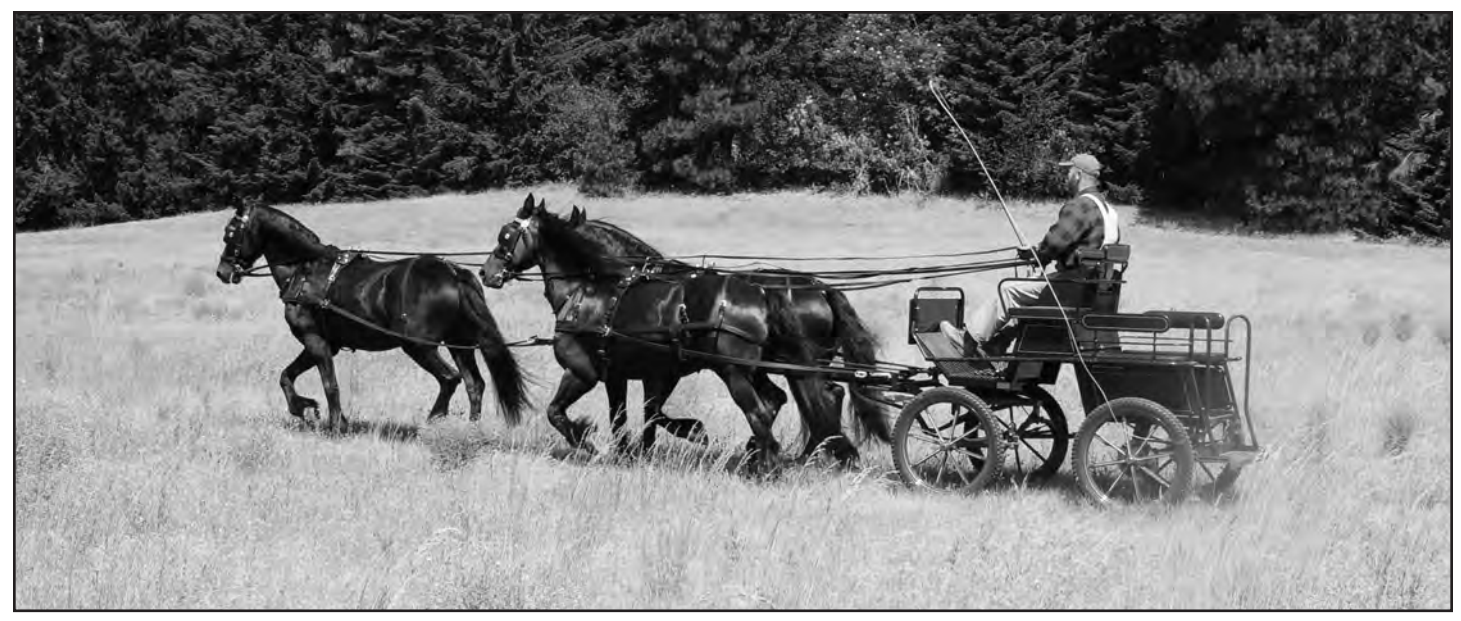
Above, the Friesian team takes Alan for a ride around the property. Below , manes fly in this carriage-seat view of the pull horses. Bottom, Alan bridles one of the Bennetts' horses for carriage.

The five they now have includes a 2-year-old foal born to one of their mares.