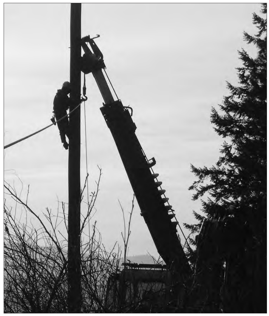
Inclement weather often damages utility systems, requiring KPUD crews to identify and repair the problems.