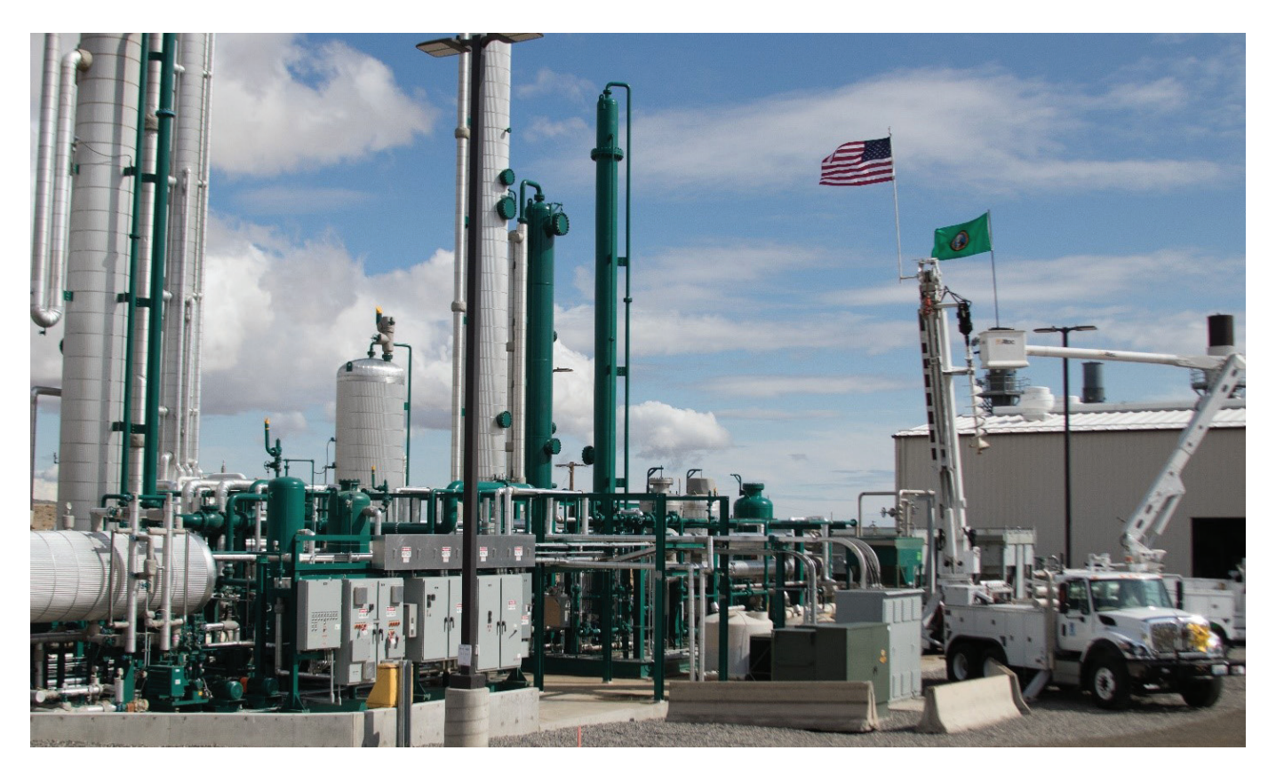
The H.W. Hill Renewable Gas Facility produces the energy equivalent of 18 million gallons of gas annually.