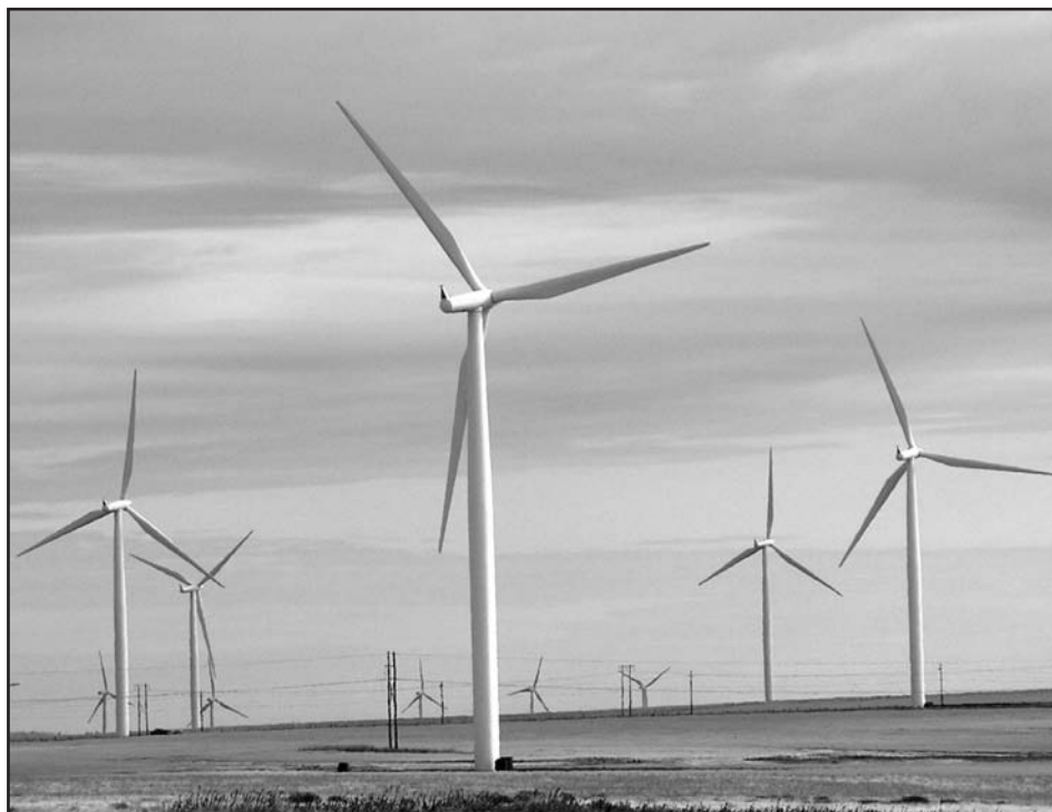
Above, wind is now producing power at the White Creek project in Klickitat County.

KPUD has sold its 26-percent share of output to Powerex until 2011, when a new BPA contract takes effect and no longer is expected to serve KPUD's load growth. ■