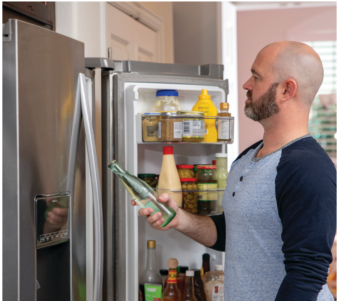
ABOVE: Replacing an old fridge with an Energy Star-rated model can cut the monthly cost to operate from $20 to less than $5 a month. RIGHT: The Energy Guide label helps consumers estimate their annual energy costs for appliances.

The Energy Star label certifies that the appliance saves energy. New refrigerators will include an additional label—the Energy Guide label, which shows how much energy it uses annually and compares that to the most- and