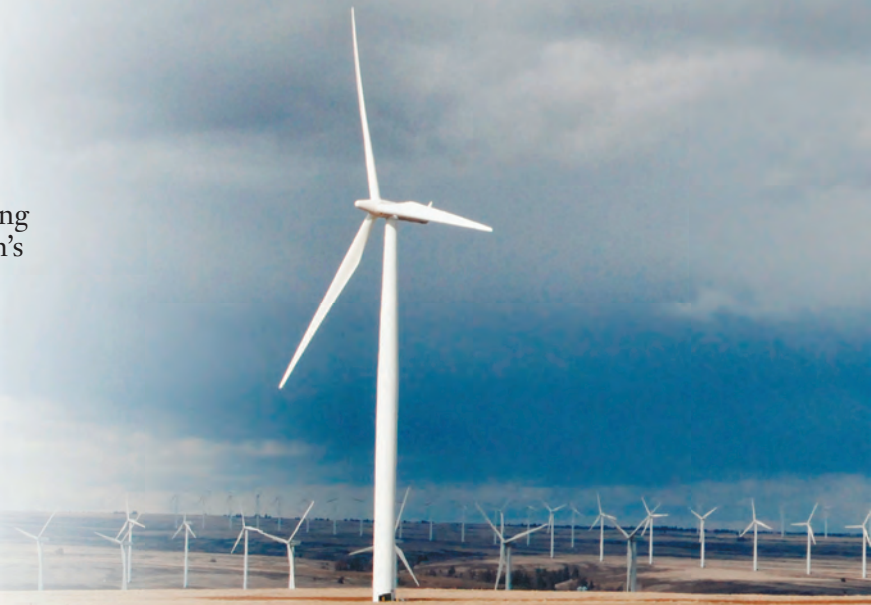
The White Creek Wind Project in south-central Washington has 89 2.3 megawatt turbines.

Although White Creek Wind I is owned by an investment group that sells the output to the four utilities, its development was initiated by the utilities as members of