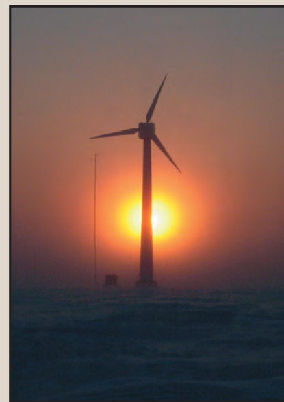
Sunrise silhouettes one of three 100-kilowatt wind turbines in Kasigluk, Alaska.

"We're looking at the possibility of bringing wind power to as many as 34 villages," Petrie says. ■