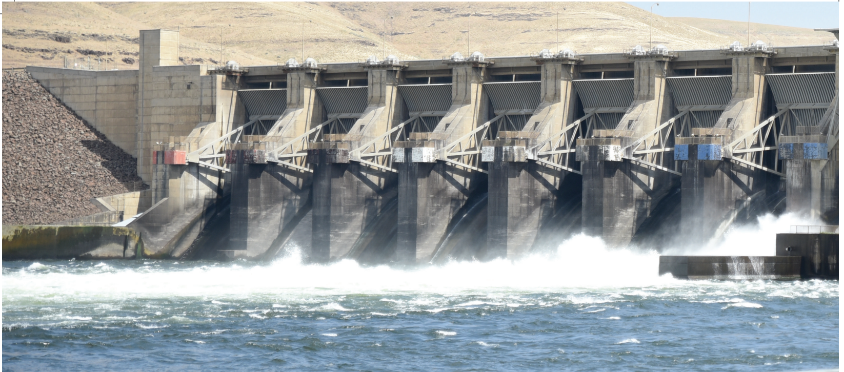
The Snake River dams' operational flexibility during extreme weather demonstrates the value they provide to the region.