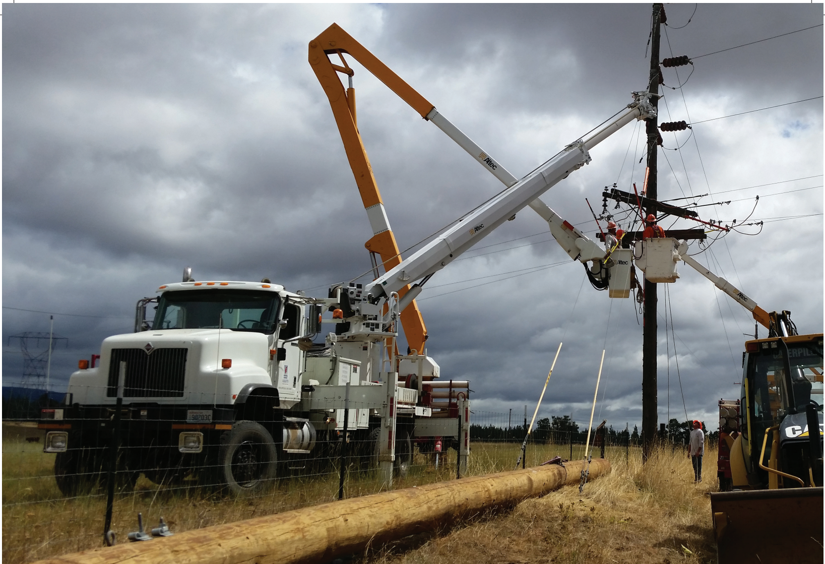
Crews work to ensure you have safe, reliable electricity.