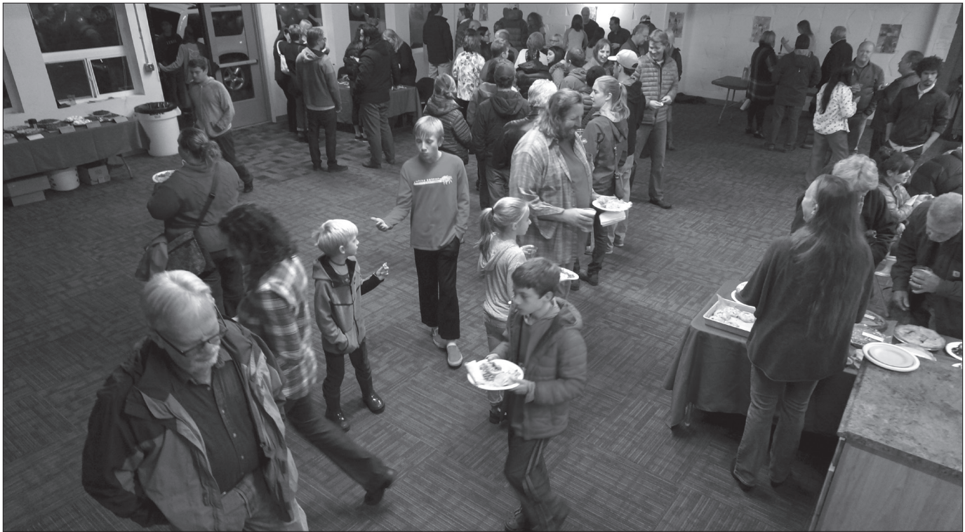
More than 100 local residents attended a fundraiser to help those affected by the Underwood Fruit & Warehouse fire in October.